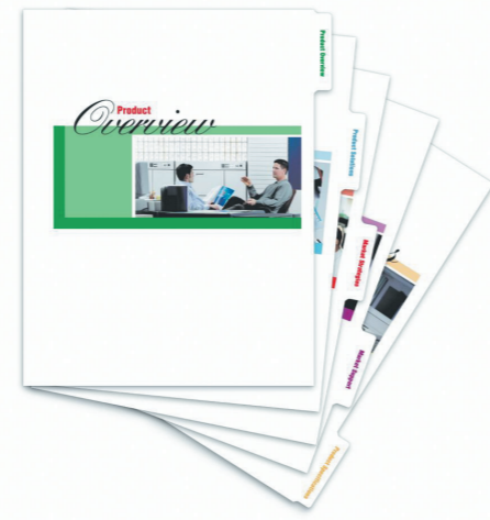
Island style Each tab is a similar size

Should our stock range not cover your needs, then try our customer service team. We can provide a different number of tabs, sets and stock. Contact your Antalis account manager to discuss your specific requirements.